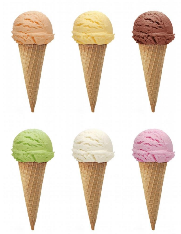
1 - ice cream

Year 2: We have been working hard on a new unit in maths about statistics. They have learnt about tally charts and tables. Why not collect some data at home about favourite colours or ice cream flavours? Ask the children questions about the data that they have collected.