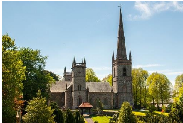
1 - archi

Year 2: This week year two have taken a visit to St Edwards Church to reinforce their learning in RE about what makes buildings and objects sacred.