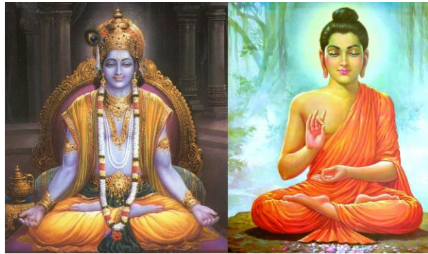
1 - hin

Year 3: the children have been finishing their learning about Hinduism and the story of Rama and Sita. The children have really enjoyed this unit, please ask talk to your child about their knowledge of the story, I think you will be amazed!